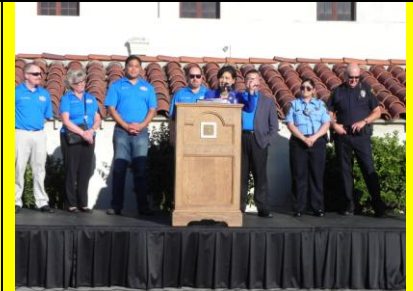
San Gabriel prepares to take a bit out of crime at the city's 21st Annual National Night Out on August 4, 2015. View more pics.